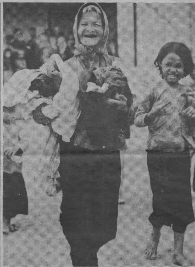
HAPPINESS IS—This grinning Vietnamese mother and her daughter were among the 234 needy families to receive clothing during the MAG-36 Marines' latest visit to the island of Ly Son.